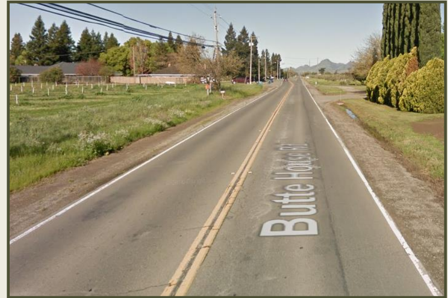
Butte House Road, between Delle Drive and Royo Ranchero Rd. No paved shoulder.