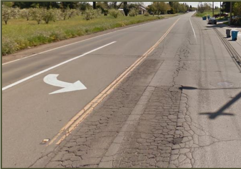
Butte House Road, near Royo Ranchero intersection, facing east.