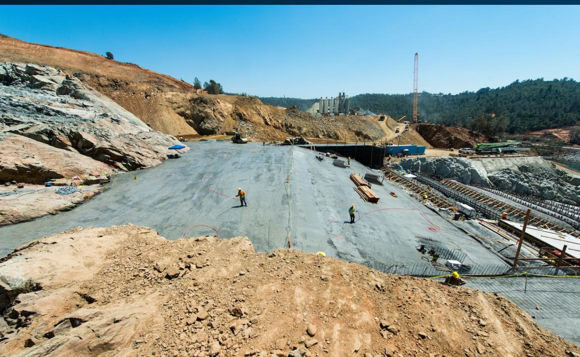
Roller Compacted Concrete