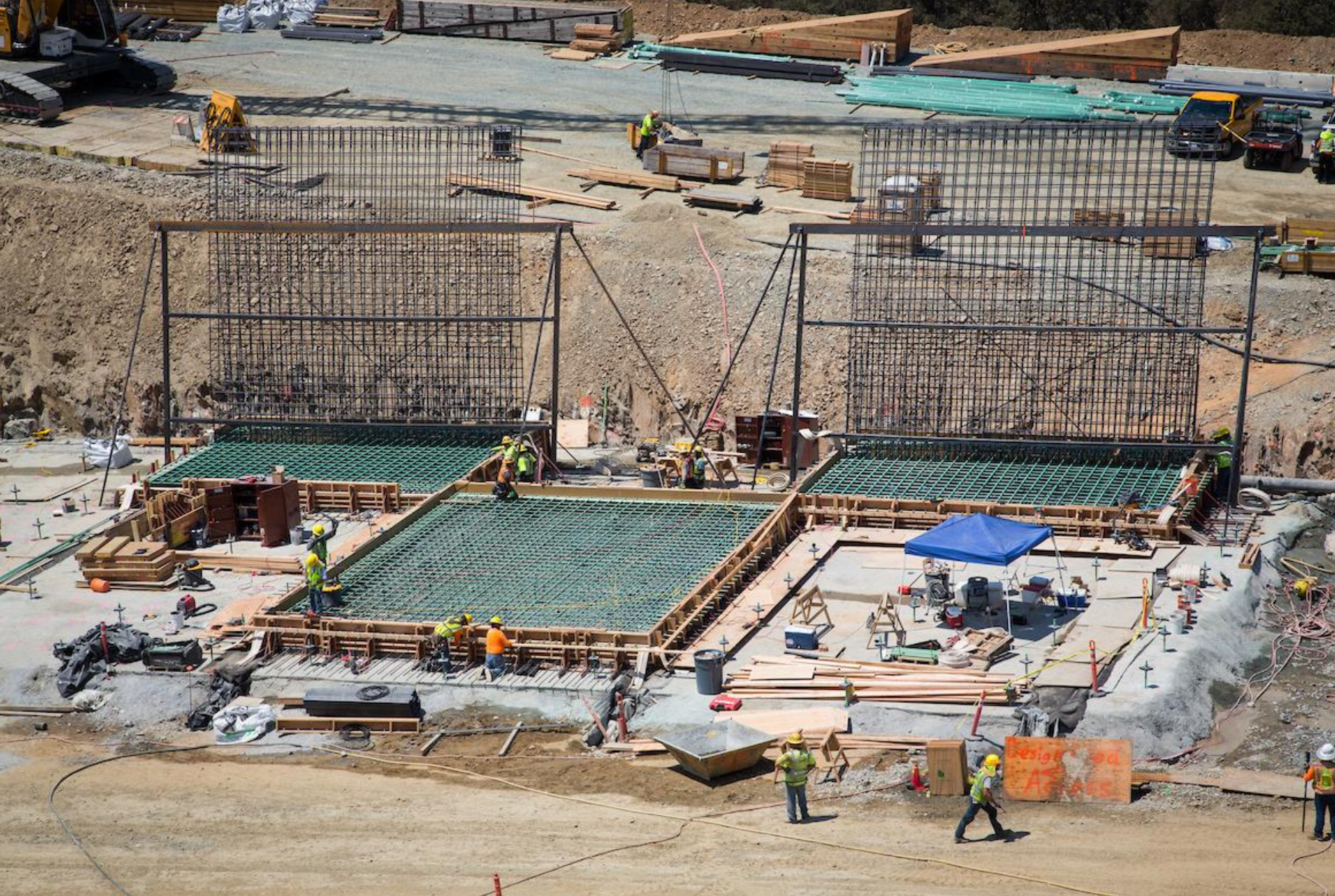
Forms/rebar for structural slabs and walls