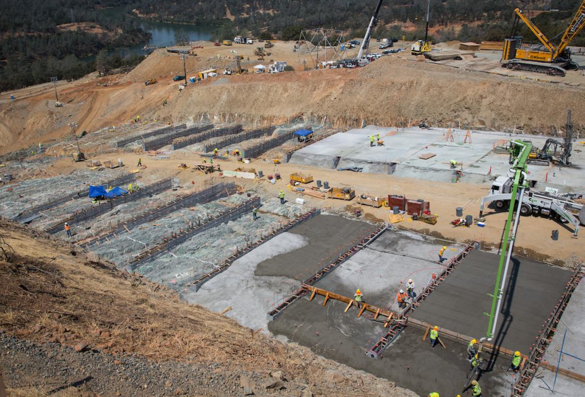
Upper Chute Construction