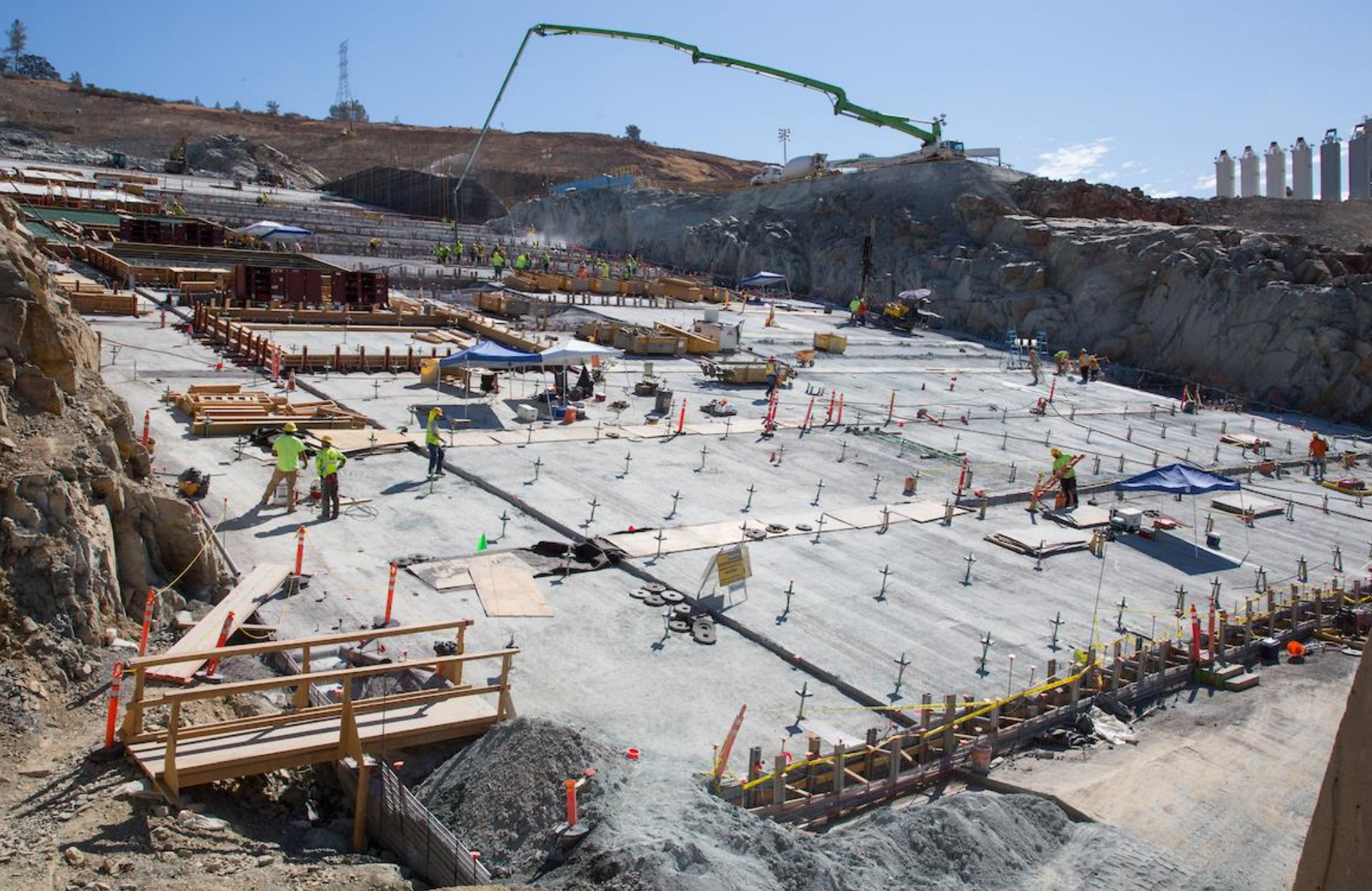
Lower Spillway Chute