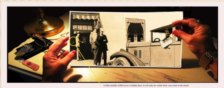
A little metallic Eiffel tower is hidden here. It will only be visible from very close to the mural