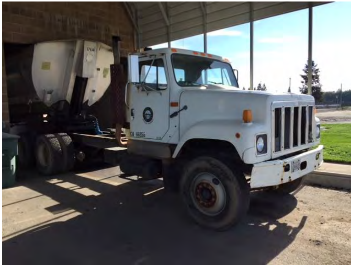
Existing Converted Dump Truck