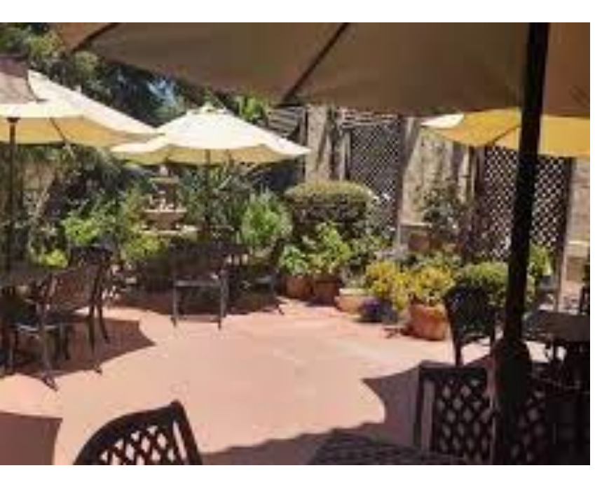
El Zarape Restaurant