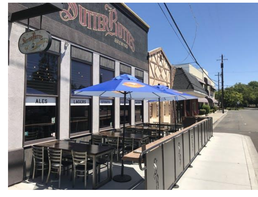
Sutter Buttes Brewery