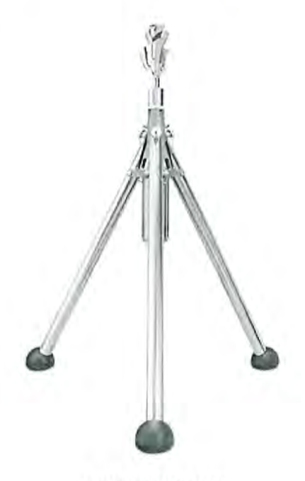
PAX SERIES400 MIXER

PAX Water Technologies, Inc. Prepared on: September 6, 2018 PAX case quote # 3736