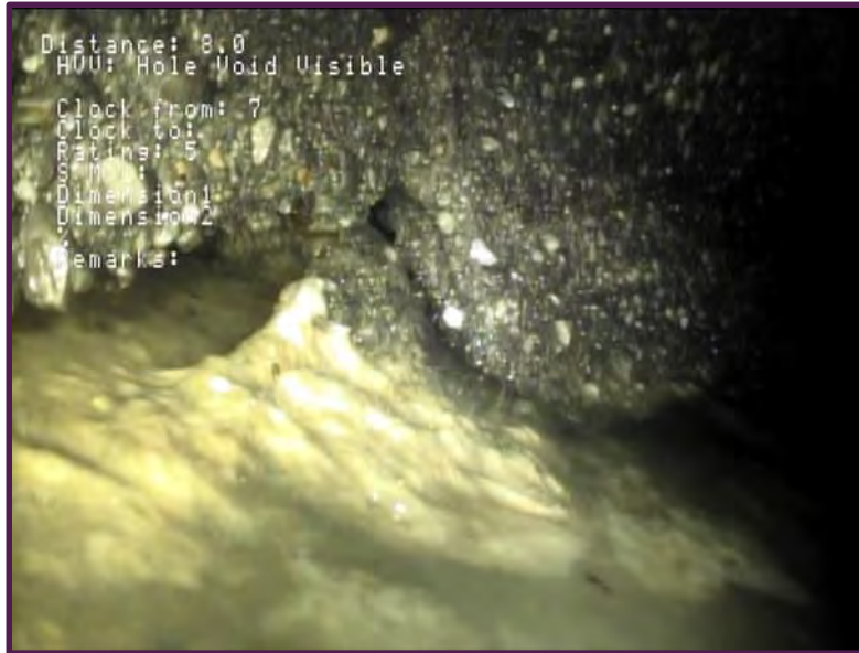
Structural hole in pipeline on Wilwick Way